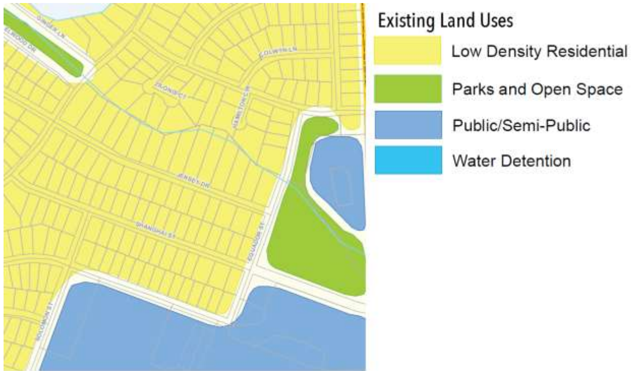
Map 3: The existing land use zoning within the TIRZ.